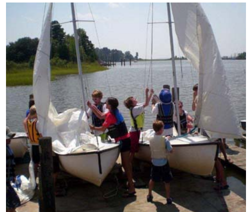
Junior Sailors race to rig their boats during the Fisherman's Race.

weather. The season ended with the much anticipated Fisherman's Race that included serious competition (a sailboat race), off-the-scale fun (contestants eating cream pie, lipstick on faces, and consumption of crackers) and much infectious laughter from those involved. The Adult Sailing Program ended with a night sail on the James River with some sailing and lots of socializing. The adult sailors have learned a lot and come away with a new appreciation for sailing. Thanks to all who helped with this year's sailing programs and set us up for success in the coming years!